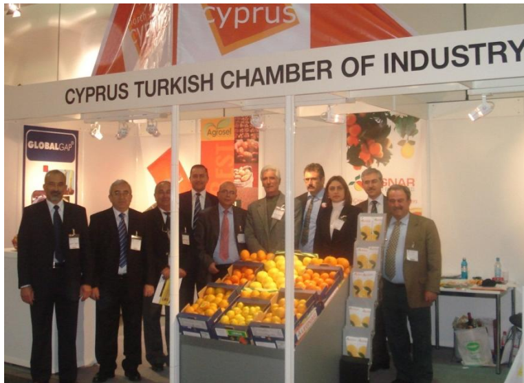
CTCI and producers at a global fair

discussion among experts, business leaders, journalists and intellectuals on the need for change. Through the media, the Competitiveness Forum became an efficient mechanism to spread awareness to the public at large and foster a dialogue with diverse stakeholders including over the Green Line. One result was the initiation of a broad-based dialogue—including political, business and labor leaders—on the lack of private sector competitiveness. The impact of such a dialog is difficult to overestimate. As a result of these meetings, a constituency for business climate initiatives was built, and the participants were driven to promote better diagnosis of sectoral problems, and to promote policy reforms.