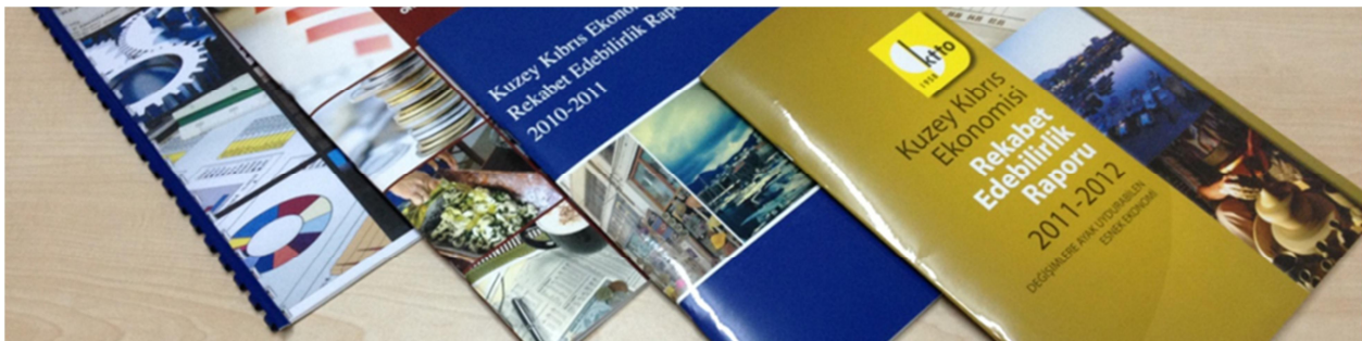
Competitiveness Reports produced and published by TCCC

EDGE also institutionalized the support of businesses attending international trade fairs. The CTCI has a dedicated unit that works with members to attend trade fairs in Europe and the Middle East. In fact, just one week after the project ended, the CTCI supported traders in attending the Berlin Fruit Logistica Trade Fair, which is just one of many CTCI-driven trade visits to come.