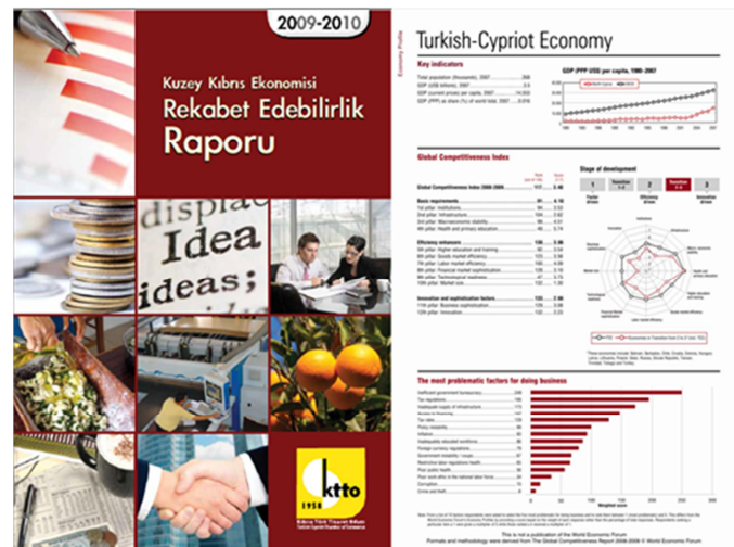
First Competitiveness Report on the Turkish Cypriot community

Building the understanding of competitiveness and the place of the TC economy within broader global competitiveness began with the groundbreaking work undertaken by EDGE with the Competitiveness Report on the TC economy. Before EDGE introduced the first competitiveness report in 2009, there were few studies and no benchmarking of the TC economy against any other economies. "Flying blind," the TCC could not see where it was competitive and where improvements were needed. Recognizing this, the EDGE team facilitated the publication and dissemination of the first two (2009 and 2010) Competitiveness Reports on the TC economy.