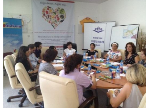
Meeting between the TCDA and Atakom for planning the Eat Right, Live Healthy program

The “Eat Right, Live Healthy” CSR project was designed by the TCDA to raise awareness of healthy eating and exercise choices that can positively impact overall wellness. Atakom Ltd., a major TC trader of primarily food products including a line of competitive high-fiber food products, teamed up with TCDA to engage local leaders from seven target areas. The first phase involved a survey to understand the awareness level of healthy living in the target villages. The TCDA members also took measurements, introduced the basics of healthy eating habits and the benefits of physical exercise on overall health. Phase two will entail a series of follow-up visit after several months to track awareness and behavior change as well as to distribute additional information. The CSR project was awarded with “Best CSR Idea” award by the producer company of the high-fiber food products from Turkey.