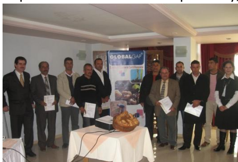
GlobalGAP certification ceremony

When the EDGE team began working with the TC businesses and producers, it was clear that products were either lacking quality standards or lacking the certifications needed to satisfy global buyers' requirements. Even more importantly, most companies had not assessed the market demand for their