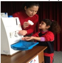
Child practices proper hand washing technique

The Chamber of Food Engineers had an idea to supply area grocery stores and supermarkets with informative brochures for the public about how to make informed food purchasing decisions and how to handle food properly for health and safety. The Chamber wanted to raise awareness for this important issue on World Food Day. While the food engineers had the idea and the information developed for the brochures, they needed funding and support in developing a full project plan. A major importer, Oero Trading, agreed that the project fit with their corporate goals. Oero agreed to fund the printing cost of the brochure, while artfully placing their products in the brochure as positive examples of safe and healthy food, thus promoting their food products in a subtle, positive way. They also were able to use the distribution networks they already had established to place the brochures in local grocery stores. As a result of this project, more than 10,000 copies of brochures and 500 matching posters were distributed and both parties were pleased by the results that they agreed to work on a second project (see below).