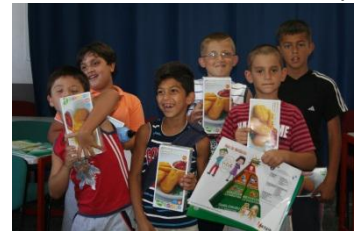
Children Graduating from Children Eat Well program

The Diabetics Association designed a four-day curriculum for primary students at summer schools, which was funded and assisted by project partner Metgin Ltd., an importer of food products, including healthy foods that children enjoy. The Association sought to promote healthy eating and exercise in children as a way to combat the rise of diabetes and obesity in the TCC. Metgin provided resources for printing the materials used, which featured their import products. Metgin Ltd. also sponsored the certificate ceremony at the end of the program and also gave samples of their healthy, kid-friendly food products. The partners then worked on the second phase which expanded the program into primary schools where they had a wider audience.