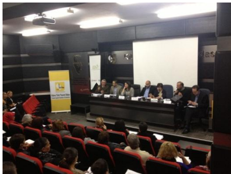
Panelists discuss lessons learned and best practices

Activities to date have been small in scale and short in duration. They were meant to allow the private sector to test the waters, trying structured and planned CSR activities for the first time. Meanwhile NGOs have seen the usefulness of developing a project plan and how to forge trusted partnerships with the private sector. Now that the private sector has an established level of comfort with CSR as a practical and strategic business opportunity, larger projects are beginning to be planned. To date, each project facilitated with EDGE support has resulted in ongoing commitments from all partners to work together on new, even larger projects.